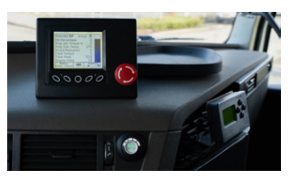
Prins is a brand of Westport Fuel Systems