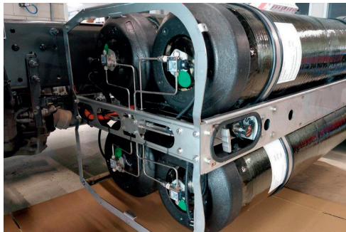
Prins is a brand of Westport Fuel Systems