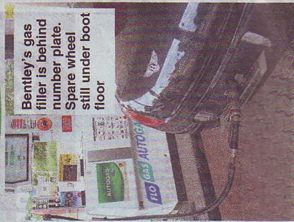
Bentley's gas filler is behind number plate. Spare wheel still under boot floor